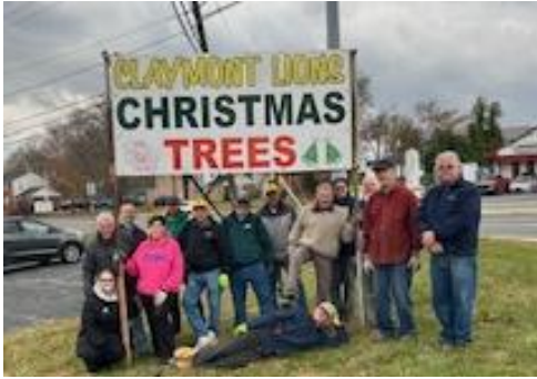
Claymont Lions Club members setting up the Christmas Tree stand and